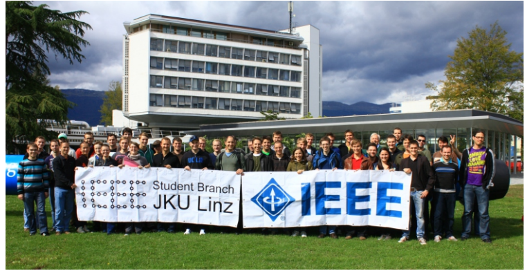
Participants of the field trip to CERN in 2012.

As our university continuously expands its range of studies (e.g., medical engineering since fall 2019), the SB faces the challenge to find a suitable program to cover the many interests of different fields of studies, to preserve a diverse community ensuring valuable knowledge transfer.