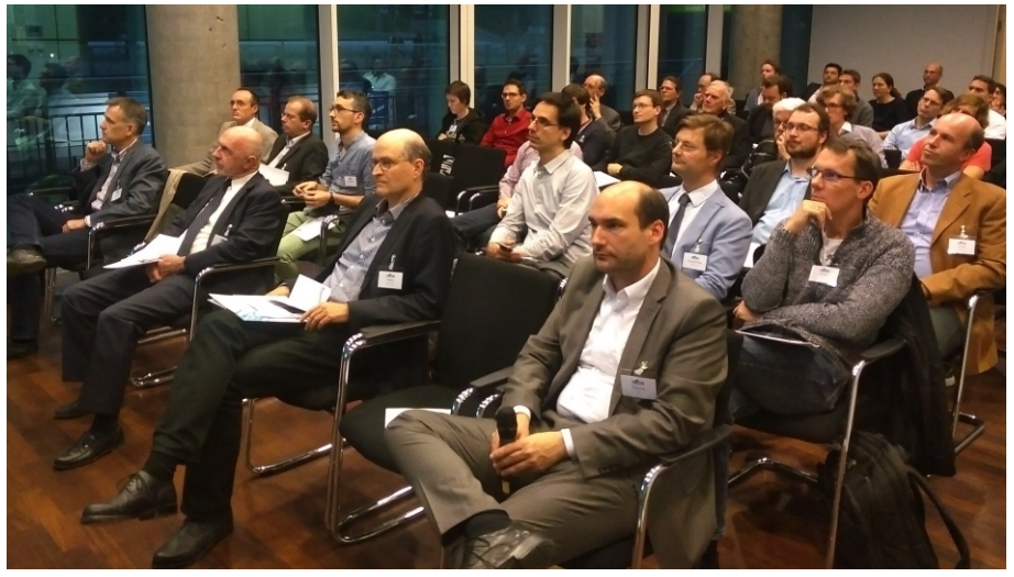
General assembly 2017 in the TechGate, Vienna.